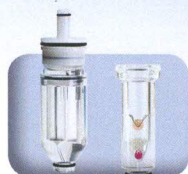
CE 7smart cells