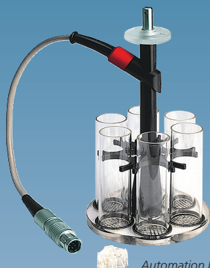
Automation basket (also available with 3 tubes for big capsules and tablets)